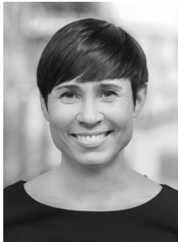
Ine Eriksen Søreide Minister of Foreign Affairs, Norway

I hope that this year’s Summit will be an opportunity to build new relationships, and that it will inspire you to grasp opportunities that can lead to increased cooperation and trade between African countries and Norway.