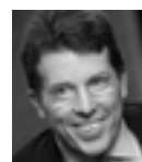
Mr. Bob Diamond CEO, Atlas Merchant Capital

The financial sector in a number of African countries have exhibited a significant growth in recent years. The key contributing factors being increased economic activity, improved regulatory oversight and low rates of financial inclusion. This session will explore investments in a previously overlooked continent.